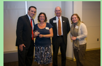
Jackson County CASA

This year, Support Kansas City had the honor of presenting Jackson County Court Appointed Special Advocates (CASA) and SAFEHOME with the 2012 Excellence in Nonprofit Leadership Awards for strong, balanced leadership demonstrated by their Board of Directors and executive staff. The 2012 Excellence in Nonprofit Leadership Awards Celebration was held at the H&R Block building.