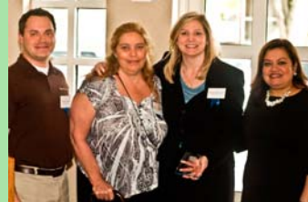
Phoenix Family Housing

EVENT SPONSORS: Deloitte, The Health Care Foundation of Greater Kansas City, Husch Blackwell, M&I Institutional Trust Services, and REACH Healthcare Foundation.