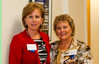
Women’s Employment Network