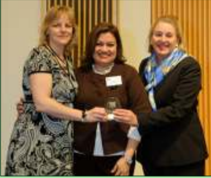
Down Syndrome Guild of Greater Kansas City

On April 29, 2010, SKC hosted a workshop and lunch event at the Kauffman Foundation. As part of the celebration, SKC launched the Excellence in Nonprofit Leadership Awards. These awards recognized exemplary nonprofit leadership at board and staff level. The 2010 recipients were the Rose Brooks Center and the Down Syndrome Guild of Greater Kansas City.